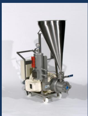
Inline High Shear Mixers