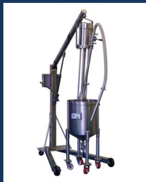
Batch High Shear Mixers

The Ross Solids/Liquid Injection Manifold (SLIM) is available on